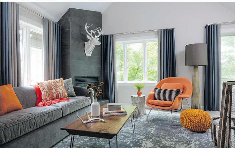
Stowe, Vt.’s Field Guide has whimsical decor, a hip ambience and a terrific location.

one to three bedrooms — have balconies offering views of Mount Mansfield, the pool and the woods; TVs in every room; bathtubs and glass showers; plus fireplaces in the living rooms.