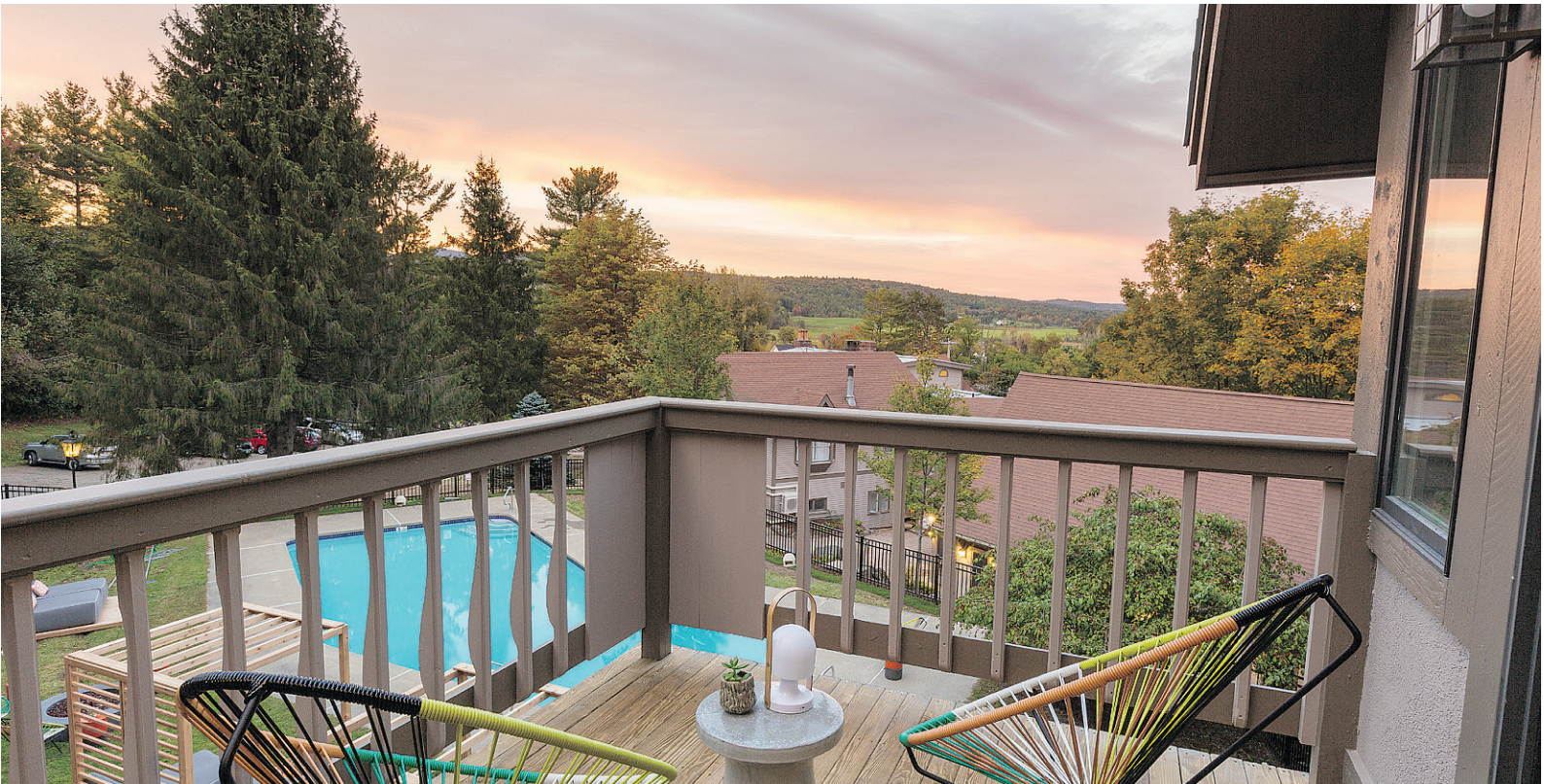
Some of Field Guide’s suites in Stowe, Vt., have balconies with mountain views.

BED AND BREAKFAST: The hotel has 30 varied accommodations, with totally new fittings, from the plush beds to the pristine white bathrooms. There are 17 guest rooms in the main lodge, ideal for singles or couples and ranging from cosy to deluxe; three darling cottages with private entrances, each for up to eight people; and 10 luxurious suites for families or friends in the Trail House. The spacious Trail House suites — with